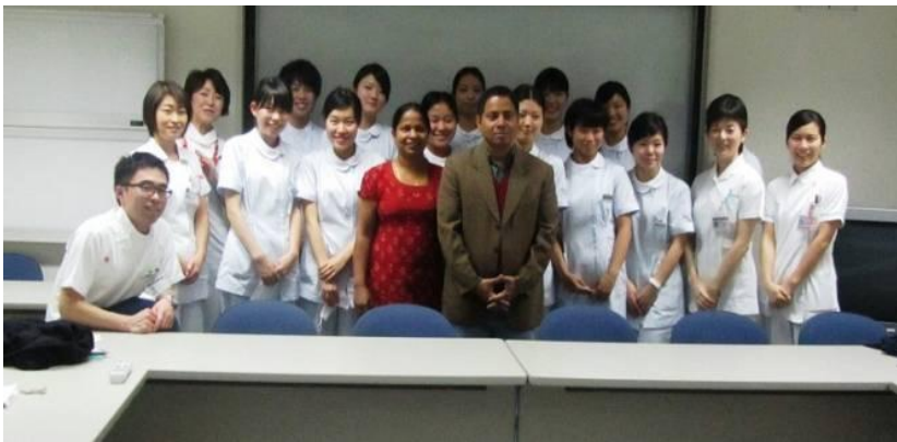
↑カンファレンスの後, 学生・指導者・教員と撮影しました。 Pictured with the students, the preceptors, and the faculty, after the clinical conference

□■2月20日(月)~22日(水), Feb 20 (Mon)-Feb 22 (Wed) □□■□■□ 成人看護学実習Ⅰの見学, カンファレンスへの参加 (国立がん研究センター中央病院) Observation of Clinical Practicum (Adult Health Nursing 1) at National Cancer Center Hospital