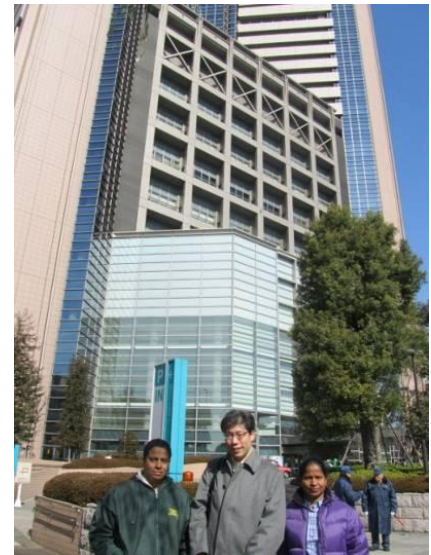
↑正面玄関前で In front of the main entrance