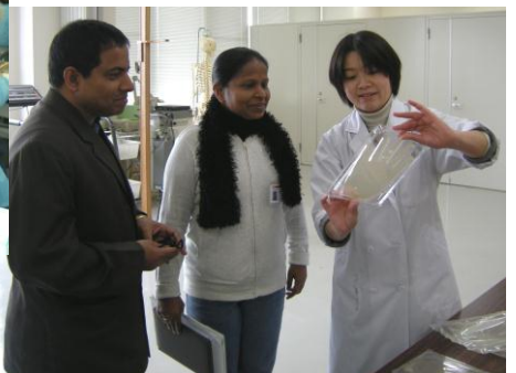
手指の常在細菌の検査を行いました。 Normal bacterial flora was checked via the "palm stamp" method.